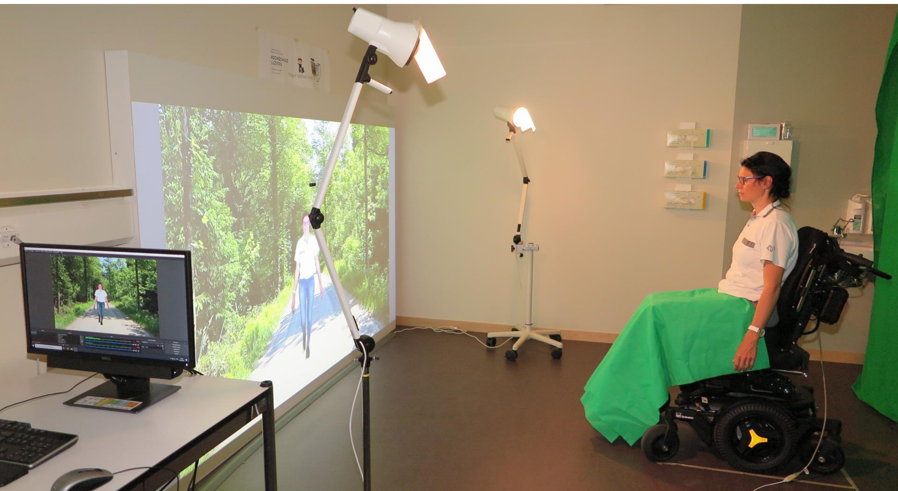
Figure 1: Clinical setting of virtual walking: The imagination of walking is realized by projecting the upper body of the patient merged on «walking legs» by computer technique. The wheelchair used in this setting provides an alternating side to side tilting to simulate the movement of the pelvis for a more authentic walking impression.

A 31-year old man with complete sensori-motor paraplegia L1, AIS A was monitored. VW was applied over six weeks: two weeks with five, two weeks with three and finally two weeks with two therapy sessions per week. The treatment setting was developed in cooperation with HSLU, for technical details see figure 1 .